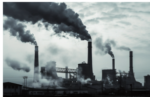
Emergency Response and Environmental Protection