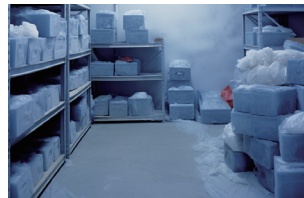
Cold-Chain and Cold Storage