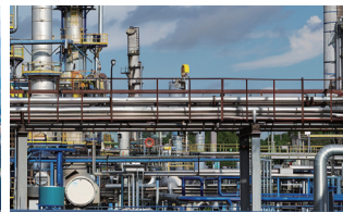
Oil and Gas Pipelines